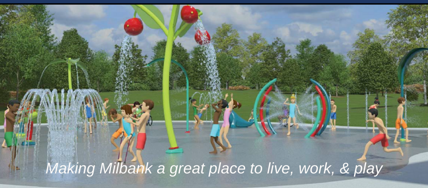
Making Milbank a great place to live, work, & play